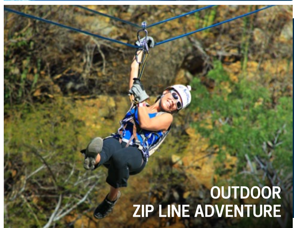
OUTDOOR ZIP LINE ADVENTURE

Few experiences are as captivating as swimming with bottlenose dolphins. And, at Cabo Dolphins, you have the opportunity to choose a swim to fit your desires. In the crystal clear water of our saltwater pools, located at our dolphin center in the heart of the marina, you will enjoy educational and playful interactions with our family of dolphins.