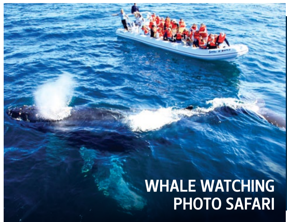
WHALE WATCHING PHOTO SAFARI